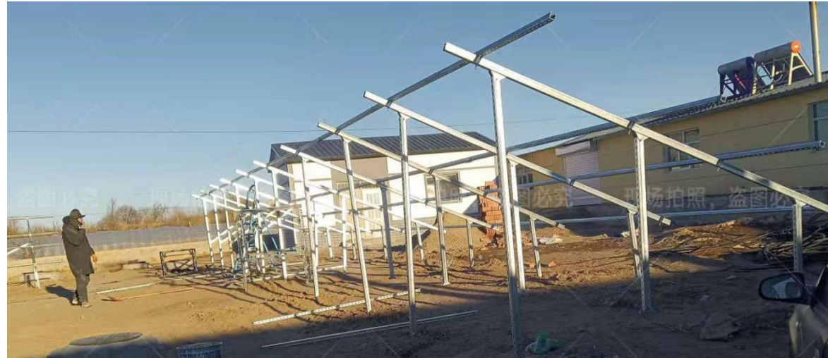
240kW photovoltaic toilet in Horqin, Inner Mongolia