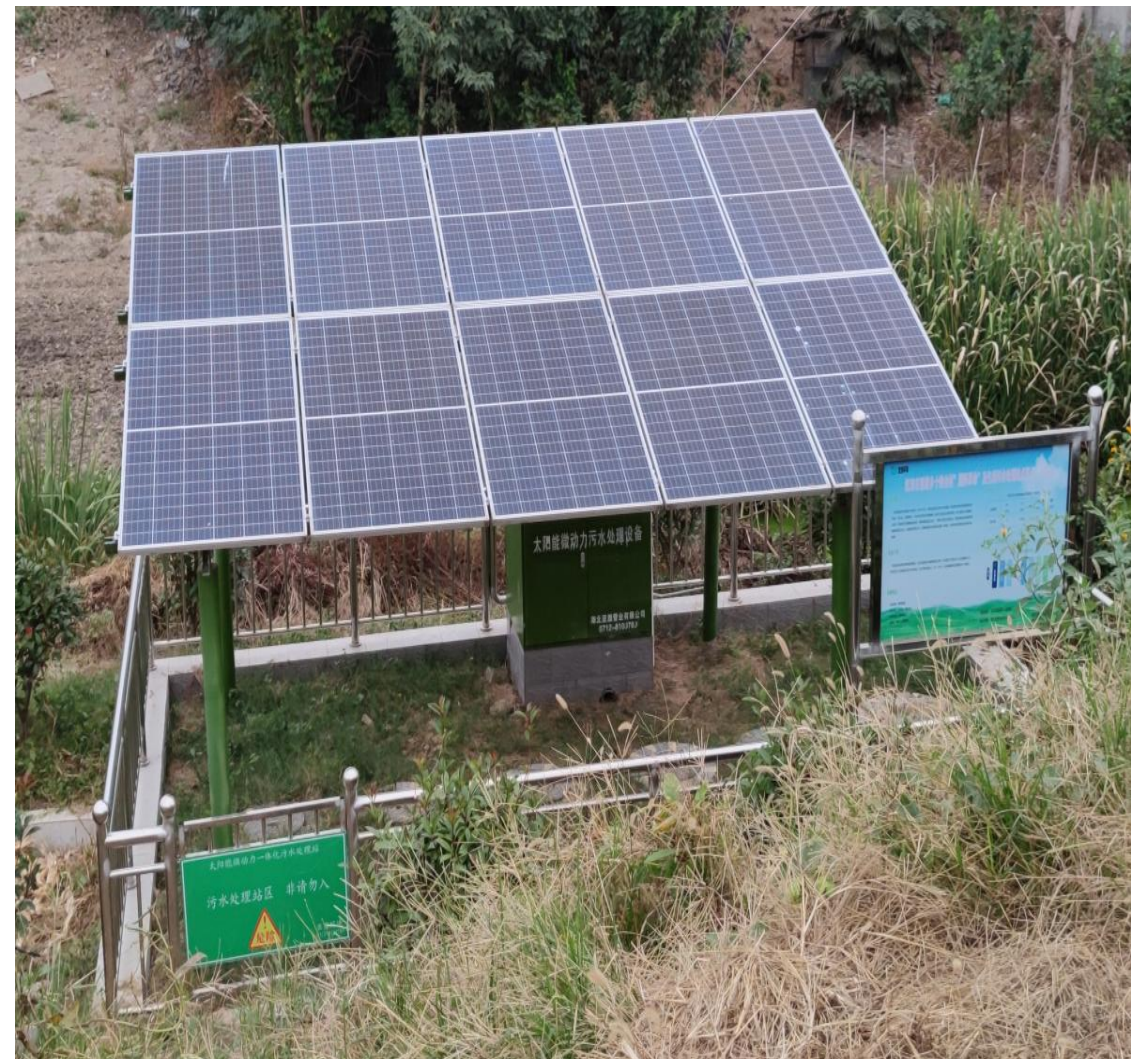
Photovoltaic monitoring in Xigaze, Xizang