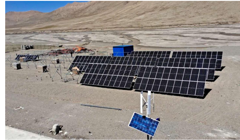
Qinghai 300kW photovoltaic off-grid