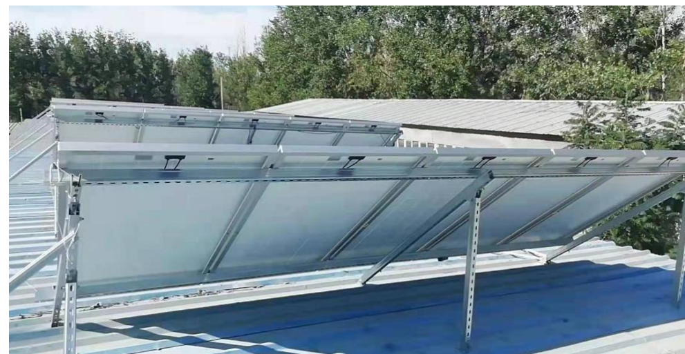
Beijing 30kW photovoltaic off-grid