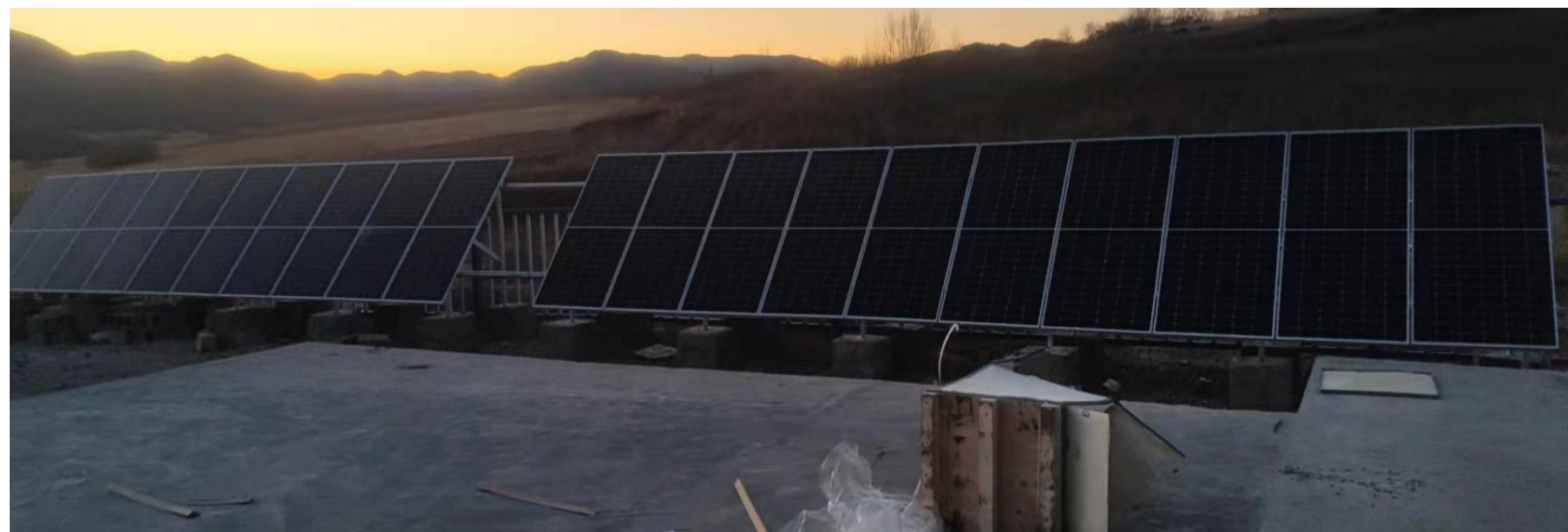
10kW photovoltaic off-grid in Hulunbuir, Inner Mongolia